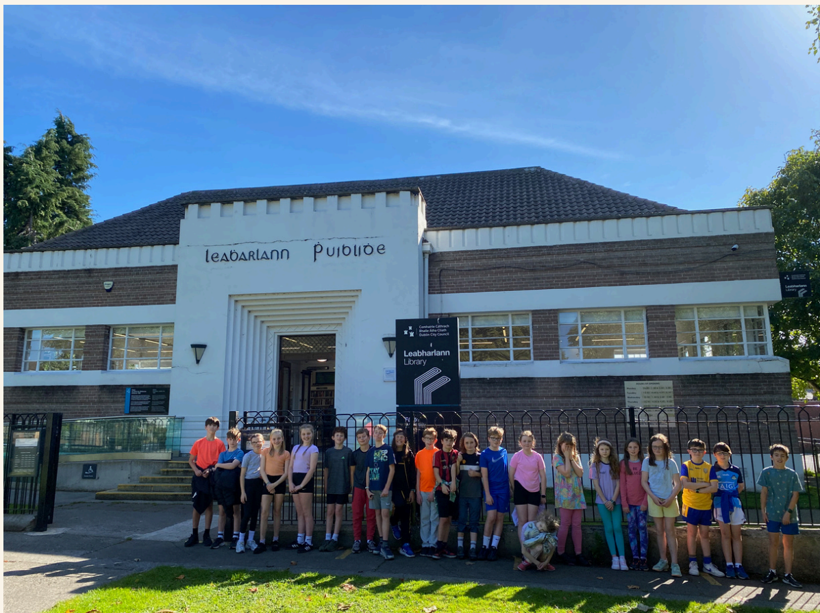
A visit to a local Art Deco style building - Drumcondra Library