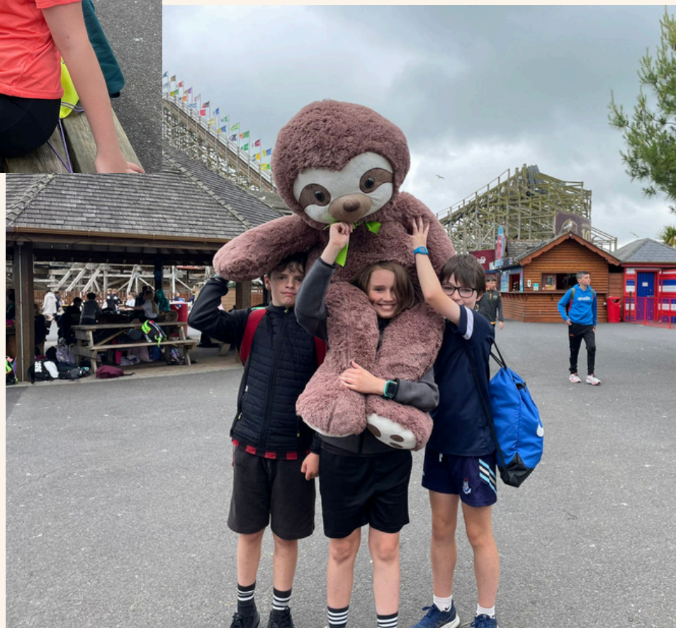
School Tour to Emerald Park