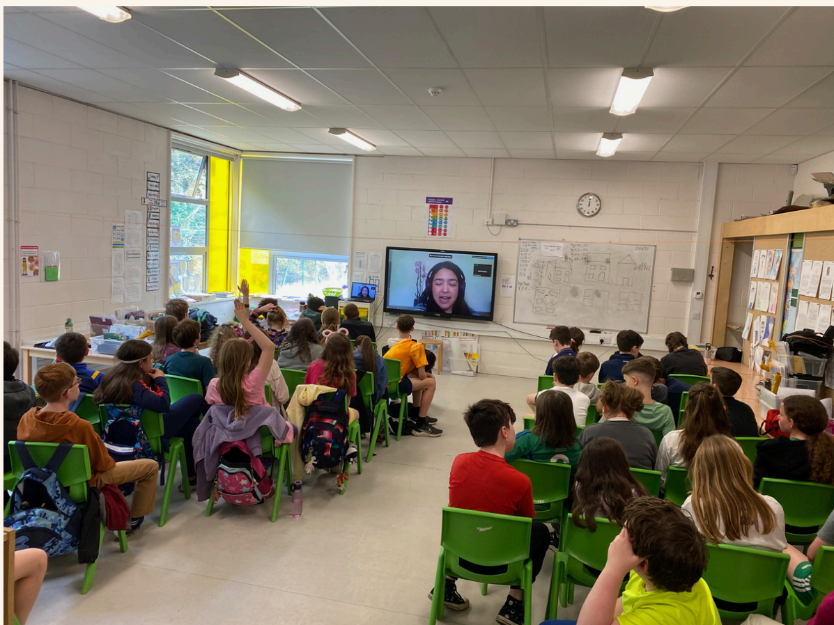
Q&A session with an architect