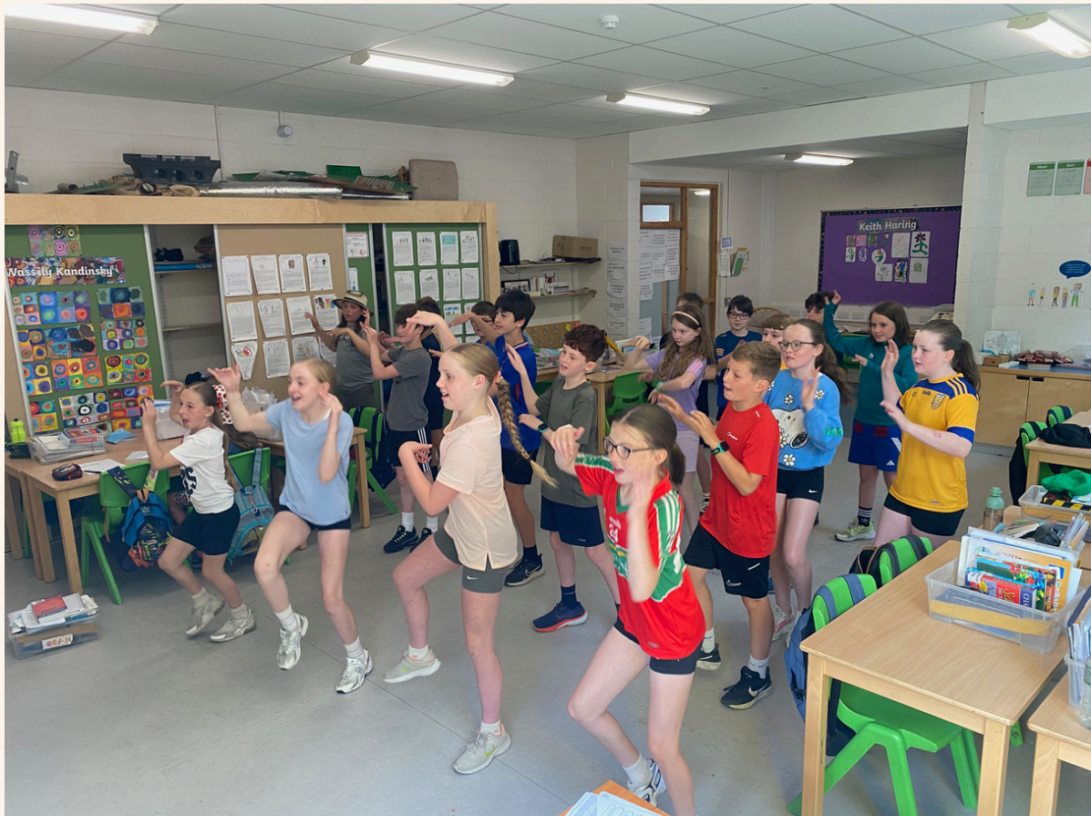
Dancing during sports day