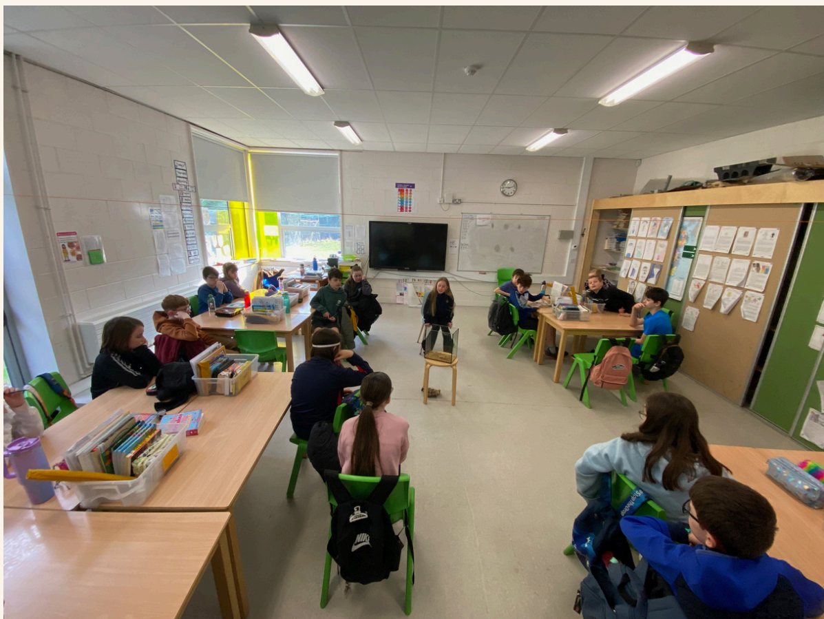
Toad's visit to Room 1