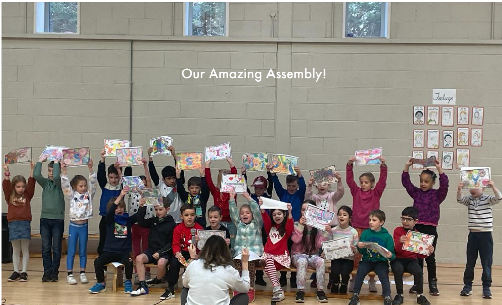
Our Amazing Assembly!