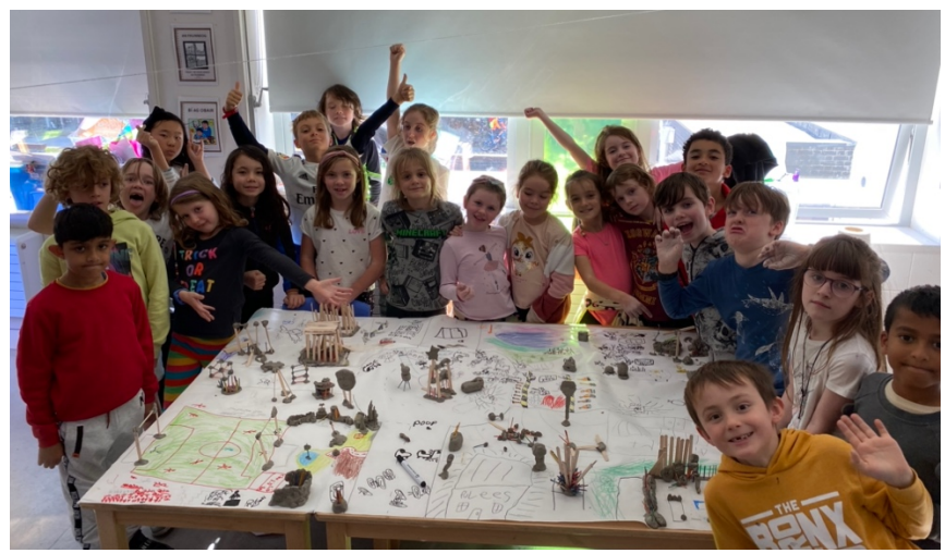
Construction – We built our own towns, deciding what we need to have to serve the population. It led to great debate and lots of listening and compromise. Our towns were amazing!