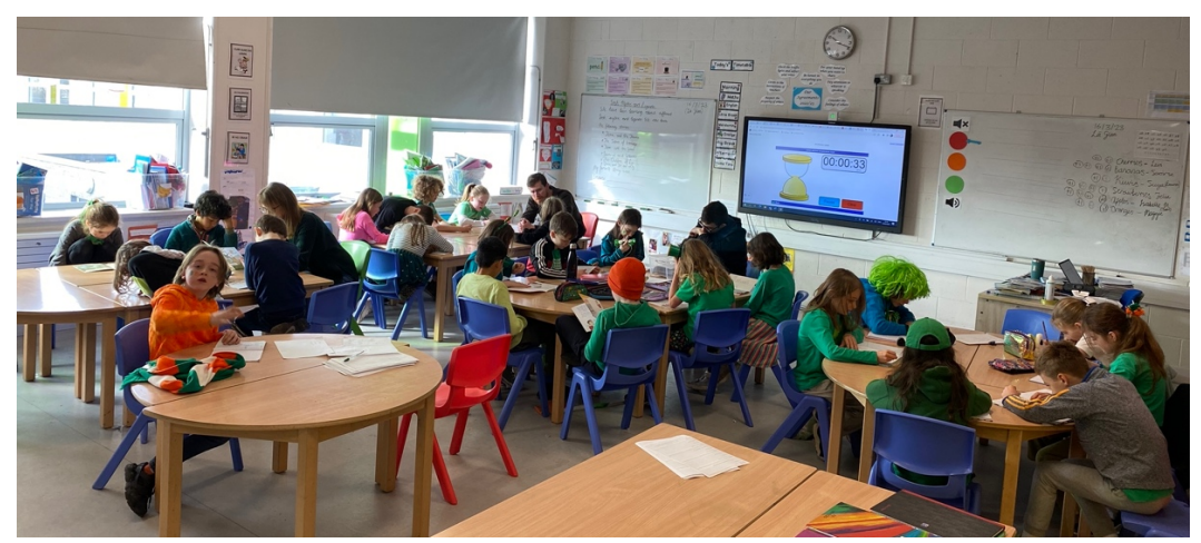
Power Hour – In February and March, we were lucky enough to have a literacy power hour in our class twice a week for a six-week stretch. It really helped us with our reading, our poetry and our writing.

\star\star\star\star\star\star\star\star\star\star\star\star\star\star\star\star\star\star\star\star\star\star