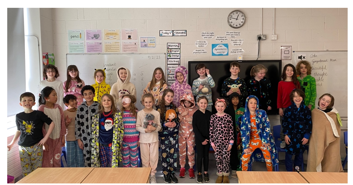
Well-being week – There were many gorgeous activities for well-being week, including pyjama day!

\star\star\star\star\star\star\star\star\star\star\star\star\star\star\star\star\star\star\star\star\star\star