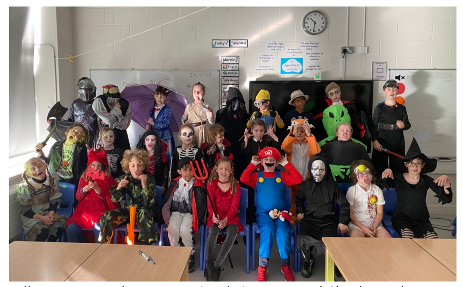
Halloween – Halloween was taken very seriously in our room! Check out the range of costumes!