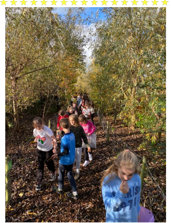
Outdoor Art – Back in November, we explored our outdoor spaces to help us create some interesting art pieces.