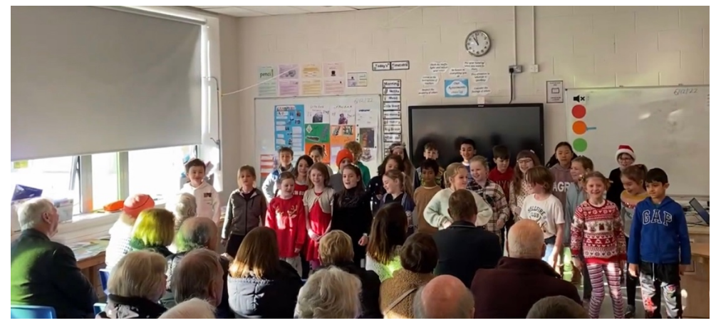
Grandparents Day – Undoubtedly one of the highlights of the year, we had the privilege of welcoming many grandparents to our class back in December. We performed 'An Hocaí Pocaí', shared our SESE projects and played some games with all our visitors.