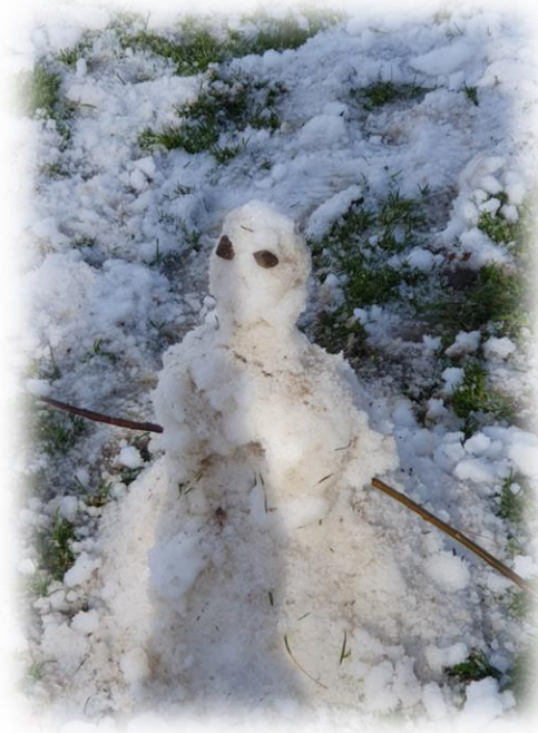
Having fun in the snow.