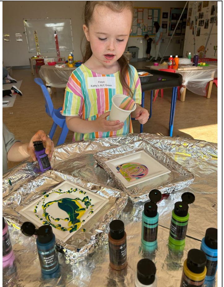
We had a fantastic time on Art Day exploring with paint colour and print. We did lots of sensory art activities in the A.L.C. area.