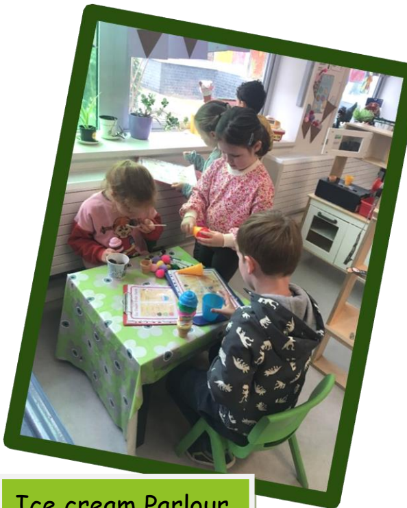
Ice cream Parlour