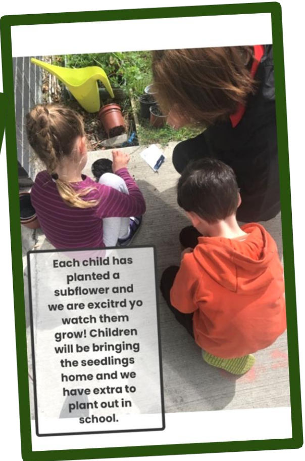
Each child has planted a subflower and we are excited to watch them grow! Children will be bringing the seedlings home and we have extra to plant out in school.