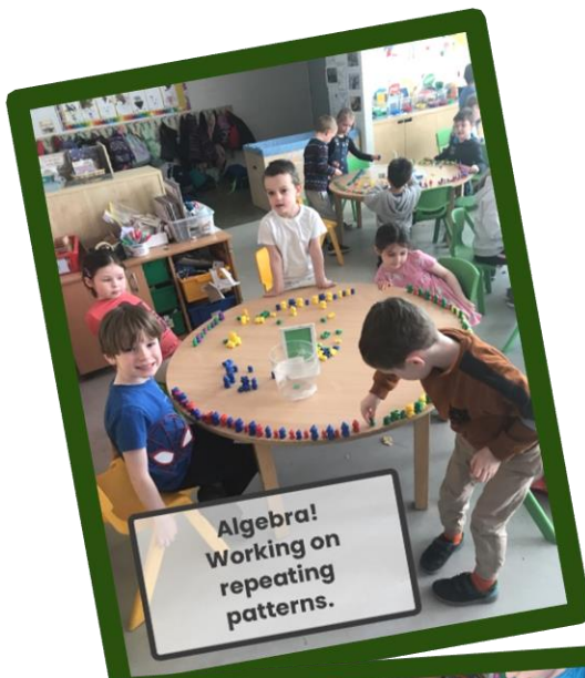
Algebra! Working on repeating patterns.

We had so much fun in Junior Infants. We made new friends, began reading and writing, have learned about dinosaurs, space, animals and nature, the arctic and more! We planted peas which we will taste next week. We love art and making things, science and listening to stories. We have learned how to speak Irish and enjoy using our Irish throughout the day. If you came to our classroom in June you might be able to buy an ice cream in our ice cream shop or go for a swim in our water area (only joking!). Take a look at our SeeSaw for a year's worth of updates!