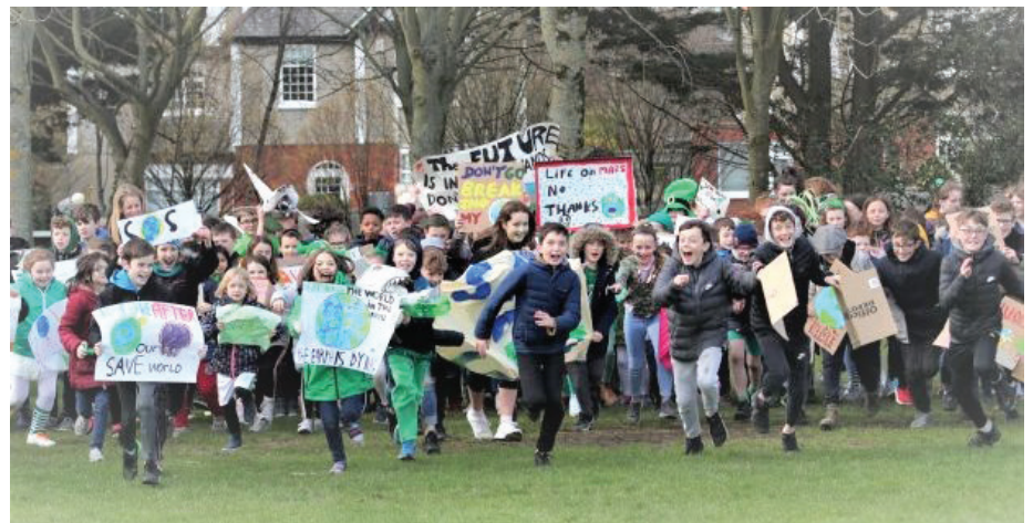
Picture of the 2019 GETNS climate protest which appeared in the Irish Times

Reading it made me so proud remembering our school was among them. 🌍