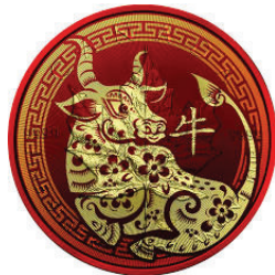
2021: Year of the Ox

February was a busy month, with Valentine's Day, Pancake Tuesday, and Chinese New Year. During lockdown, people have been extra busy making art and writing poetry to share with us. Enjoy!