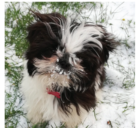
Top picture is Jeff and Rudy, and below is Pebbles in the snow!